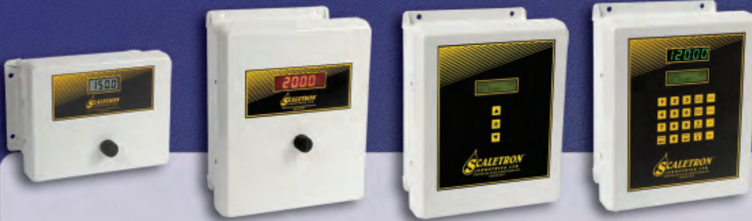
3-1/2 Digit Indicator (Standard)