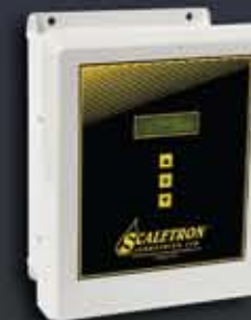
5 Digit Controller