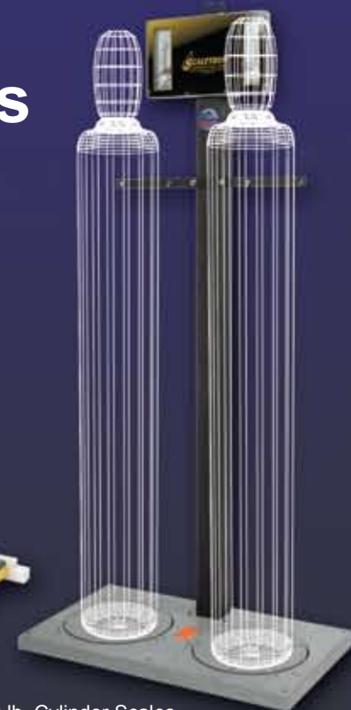
150 lb. Cylinder Scales