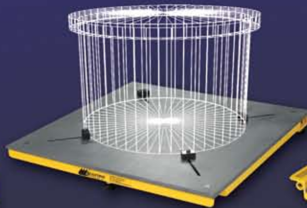
Tank and Platform Scales