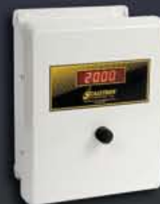
4-1/2 Digit Controller