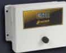
3-1/2 Digit Controller