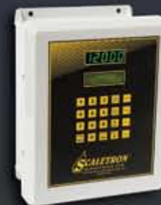
1099 Chemical Process Controller

Ideal for weighing chemicals dispersed from Cylinders, Tanks, Drums, Intermediate Bulk Containers (IBC's) and Tote Bins