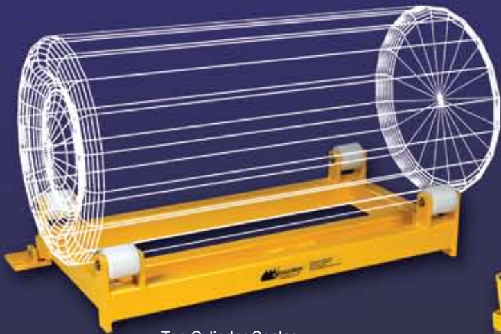
Ton Cylinder Scales