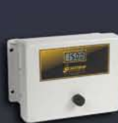
3-1/2 Digit Controller