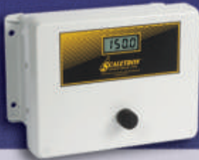
3-1/2 Digit Indicator (Standard)