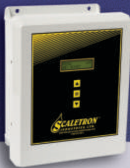
1020™ 5 Digit Controller (Optional)