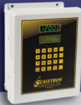
1099™ Chemical Process Controller (Optional)