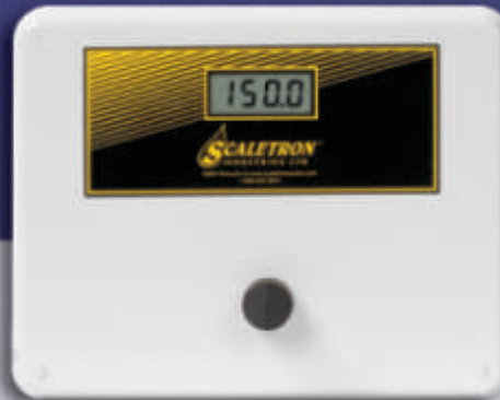
3-1/2 Digit Indicator