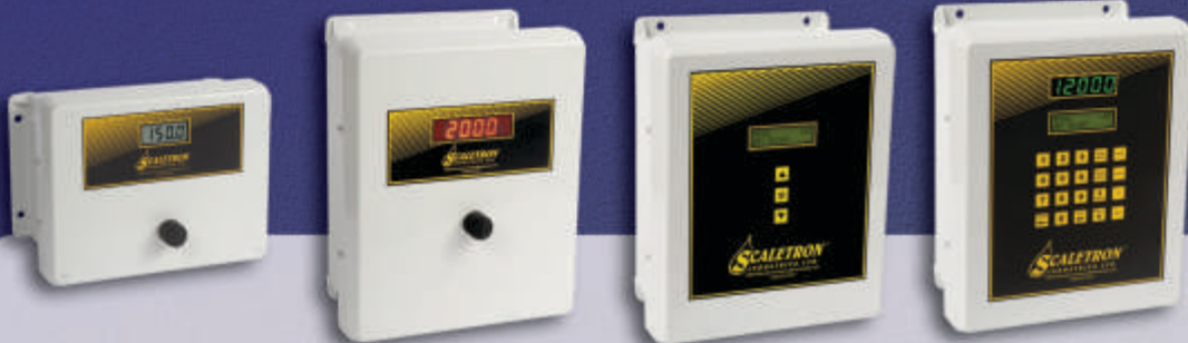
3-1/2 Digit Controller (Standard)