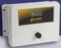
3-1/2 Digit Indicator (Standard)