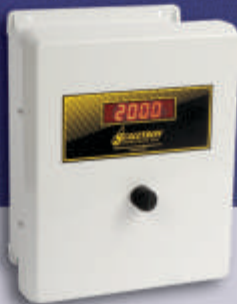
4-1/2 Digit Indicator (Optional)