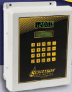
1099 Chemical Process Controller (Optional)