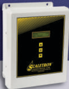
1020 5 Digit Controller (Optional)