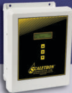
1020 5 Digit Controller (Optional)