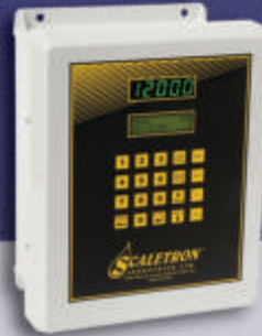
1099 Chemical Process Controller (Optional)