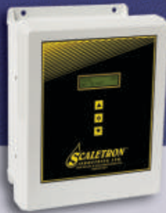
1020™ 5 Digit Controller (Optional)