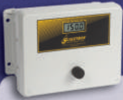
3-1/2 Digit Indicator (Standard)