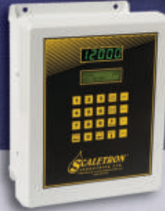
1099™ Chemical Process Controller (Optional)