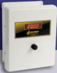
4-1/2 Digit Indicator (Optional)