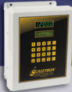
1099™ Chemical Process Controller (Optional)