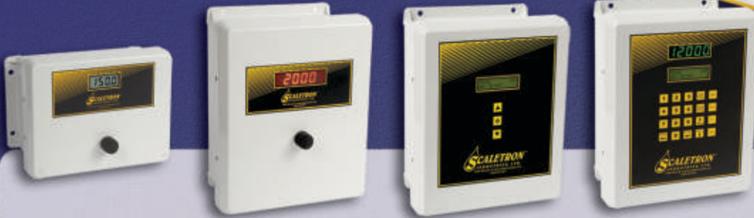
3-1/2 Digit Indicator (Standard)