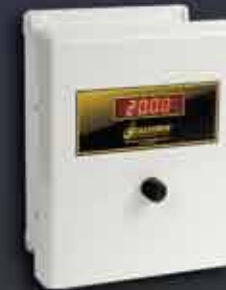
4-1/2 Digit Controller