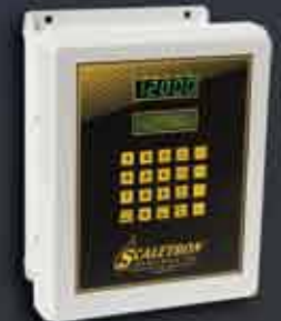
1099 Chemical Process Controller

Ideal for weighing chemicals dispersed from Cylinders, Tanks, Drums, Intermediate Bulk Containers (IBC's) and Tote Bins