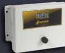
3-1/2 Digit Controller