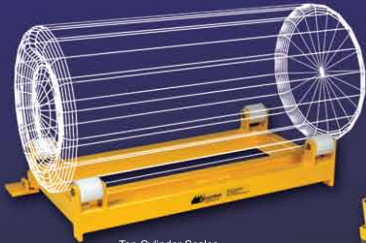
Ton Cylinder Scales