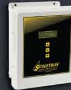
5 Digit Controller