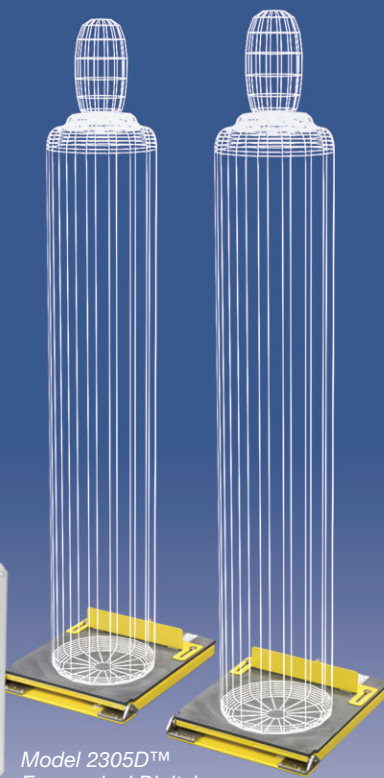
Model 2305D™ Economical Digital Dual Cylinder Scale