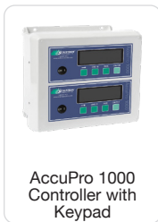
AccuPro 1000 Controller with Keypad