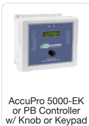
AccuPro 5000-EK or PB Controller w/ Knob or Keypad