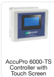
AccuPro 6000-TS Controller with Touch Screen