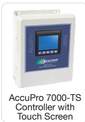
AccuPro 7000-TS Controller with Touch Screen