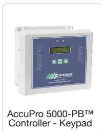
AccuPro 5000-PB™ Controller - Keypad