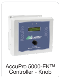
AccuPro 5000-EK™ Controller - Knob