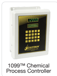
1099™ Chemical Process Controller