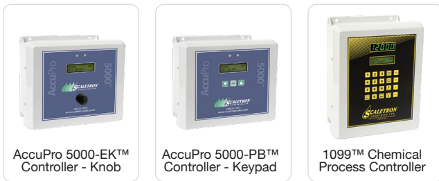
AccuPro 5000-EK™ Controller - Knob