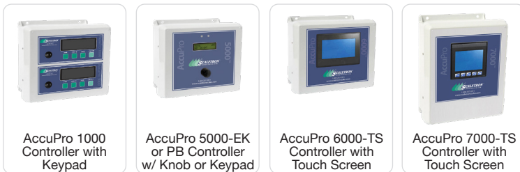
AccuPro 1000 Controller with Keypad