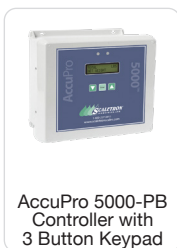
AccuPro 5000-PB Controller with 3 Button Keypad