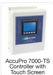
AccuPro 7000-TS Controller with Touch Screen