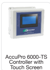
AccuPro 6000-TS Controller with Touch Screen