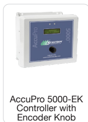
AccuPro 5000-EK Controller with Encoder Knob