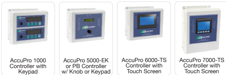
AccuPro 1000 Controller with Keypad